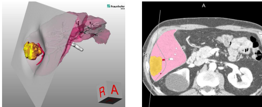
Fig. 1: Resection proposal for a non-anatomical resection of a tumor in the liver. Segmented anatomical structures and the deformable cutting plane are displayed in 3D (left) and 2D (right).

The definition of a virtual resection is an important step in liver surgery planning. Besides the necessity of preserving enough functional liver parenchyma, depending on liver disease and supply and drainage of the remnant, the distance of the resection surface to the tumor is a major concern. While ensuring these requirements, the resection surface needs to be smooth and ideally as small as possible to facilitate the intervention for the surgeon.